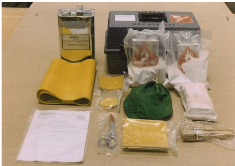
BOOM REPAIR KIT