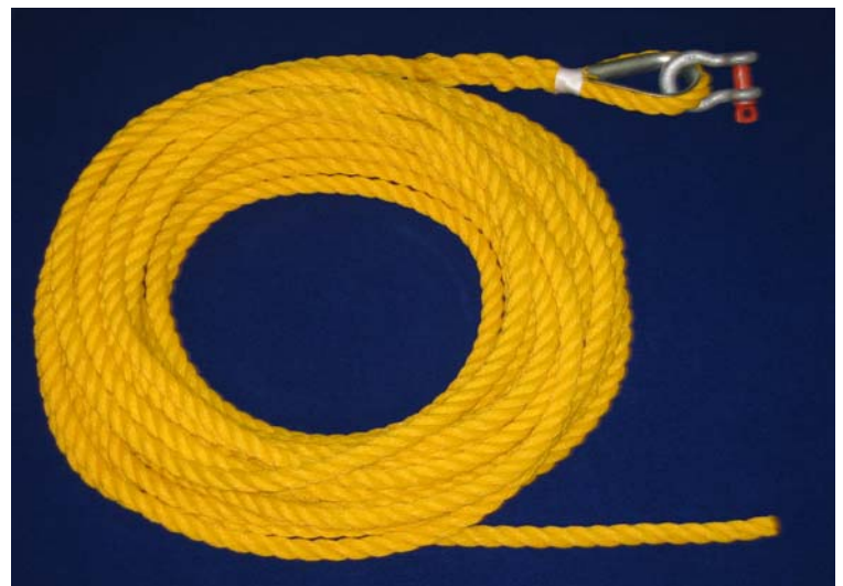
TOW LINE ASSEMBLY