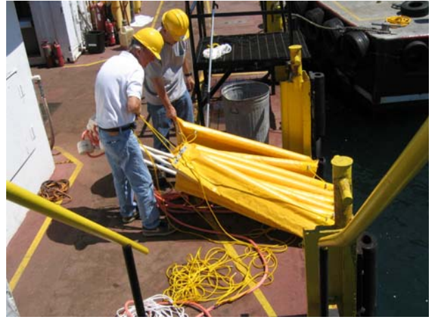
User Friendly, Easy Handling