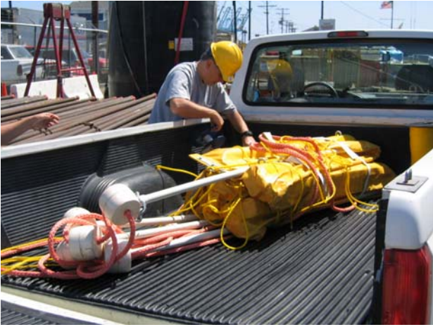
Compact, lightweight Storage and Transport