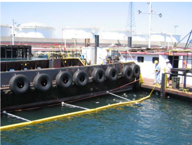
Reliable, Effective Deployment