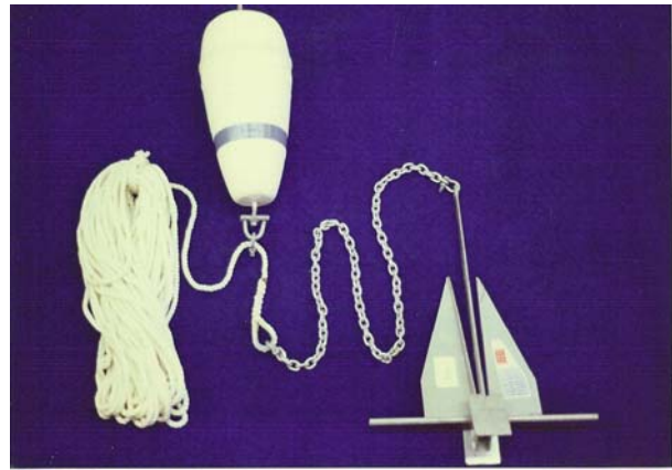
ANCHOR SYSTEM: This system includes self-burying anchor, drag chain, rode line and buoy for use with booms, buoys and in small vessel management.