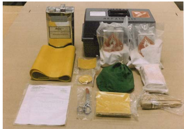
BOOM REPAIR KIT: This kit contains the tools and materials needed for most field service repairs.