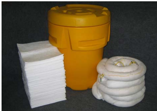
SORBENT RESPONSE KIT: A selection of sorbent booms and pads for rapid response, packed in a 95 gallon overpack drum which can be temporarily used for soiled sorbents.