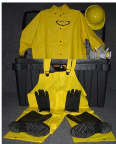
PERSONNEL PROTECTIVE EQUIPMENT: Various types of PPE Kits are shown. Custom kits are also available.