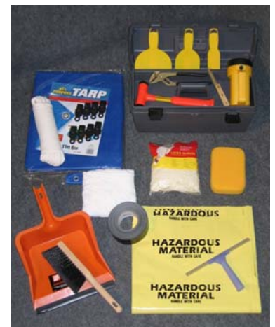
NON-SPARKING TOOL KIT: This kit has a wide selection of tools for use in flammable environments.